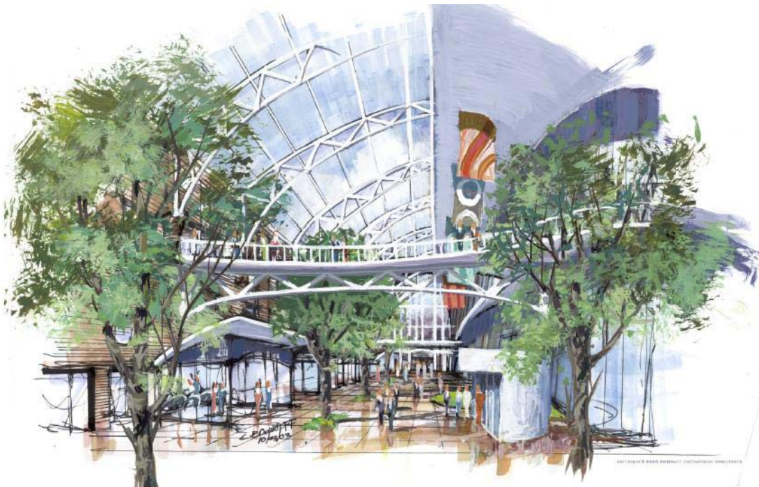
Preliminary conceptual renderings of the Rochester Central Station's street-level concourse (above and on page three) and the Renaissance Square elevation (page one) produced by the DeWolff Partnership, Rochester, NY.